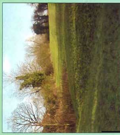
Route of new pathway from Cornwalls Meadow.