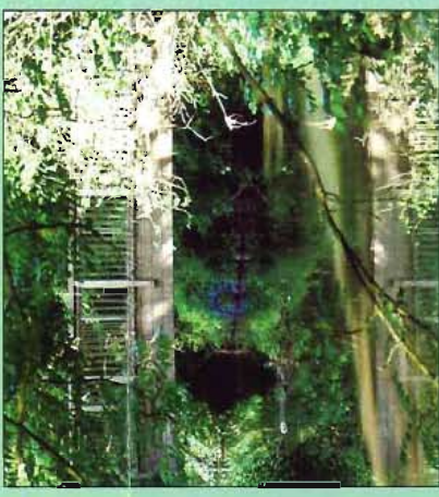
Bridge near waterfall, Station Road.