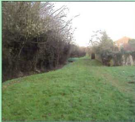
Green path through Badgers Estate.