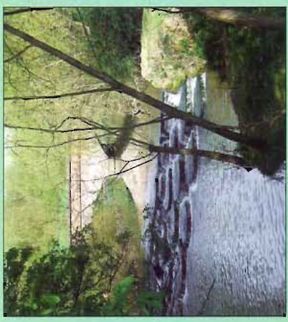
The weir (called the Floss) alongside Station Road.