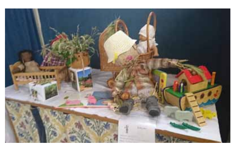
Third prize -Dingle Dangle Scaretots by Sheringtots