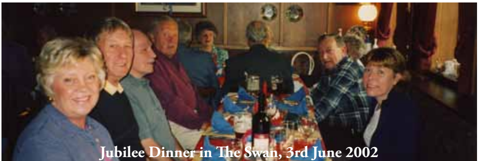
Jubilee Dinner in The Swan, 3rd June 2002