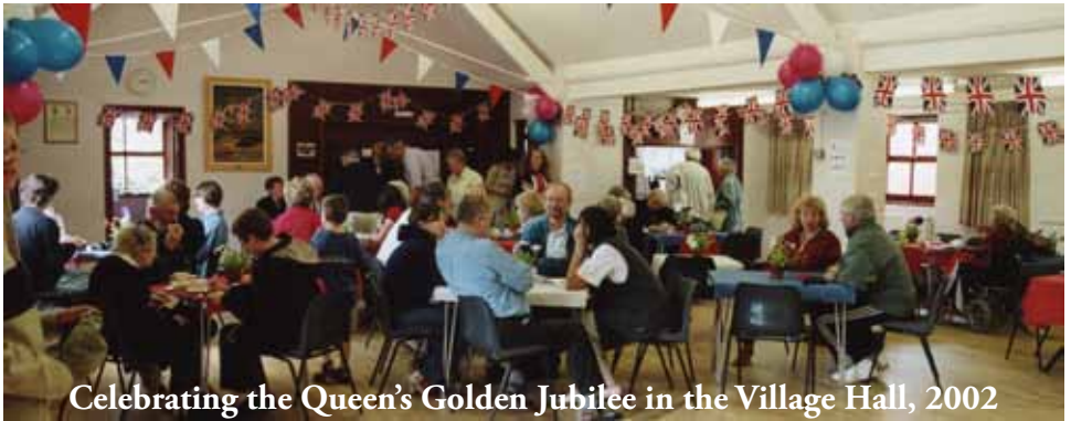
Celebrating the Queen's Golden Jubilee in the Village Hall, 2002