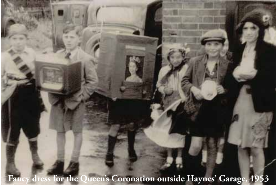
Fancy dress for the Queen's Coronation outside Haynes' Garage, 1953