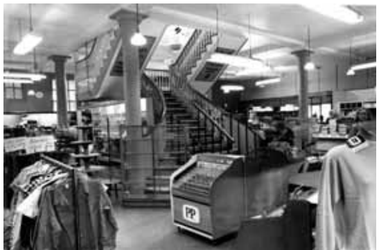
An empty unit which formerly held a selection of Pretty Polly tights