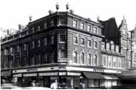
The closing down sale is in full swing at the time of this picture, October 1977

Inside, business looks steady rather than brisk. Perhaps the best items had already gone. As the displays are picked over by shoppers the place starts to look a bit untidy. My wife and her mother paid a visit to the sale about this time.